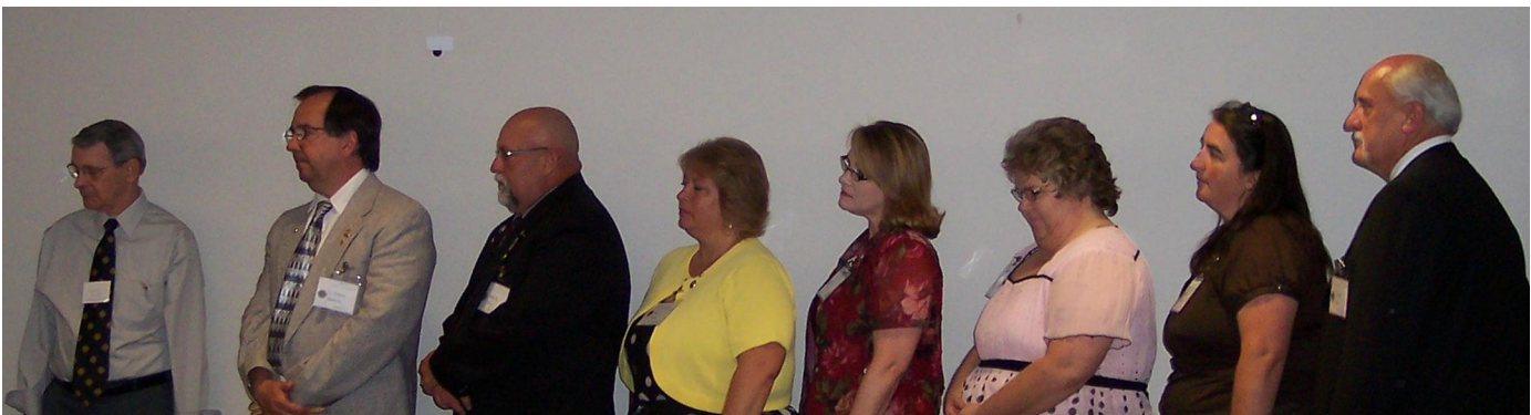
New Lion members being inducted Charter Night at Rio Grande